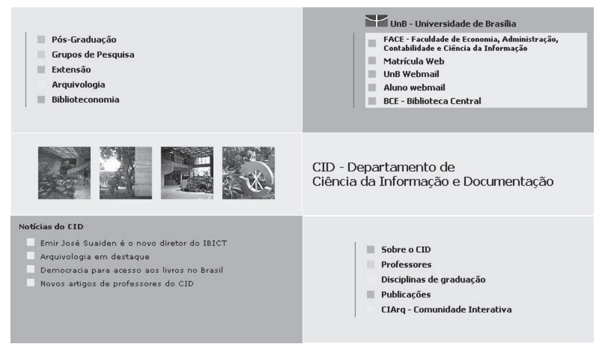
Figure 2: Portal CID/UnB FrontPage