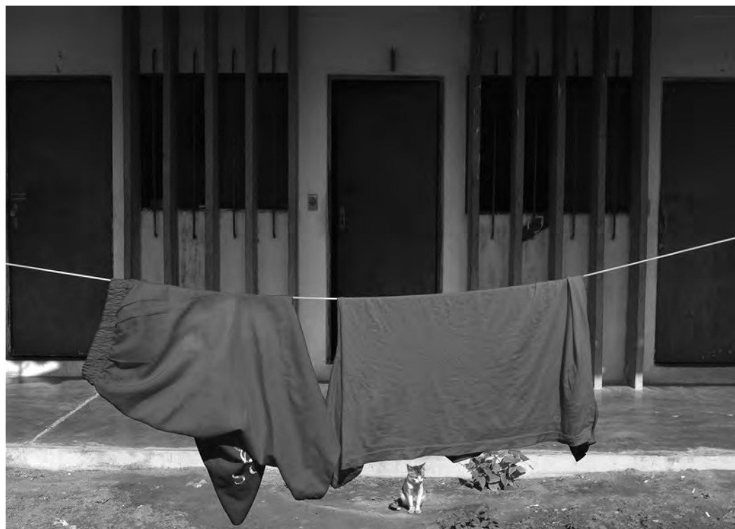
Figure 1: Clothes on the line, 2014