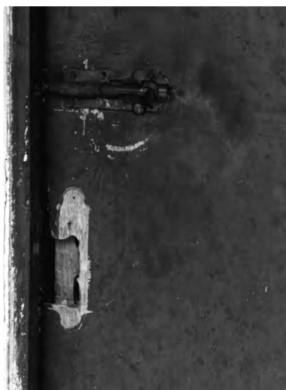
Figure 2: Security bar, 2014