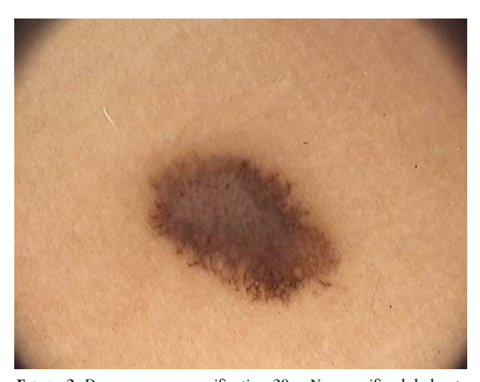
FIGURE 2: Dermoscopy, magnification 20x. Nonspecific global pattern with the presence of atypical striations (irregular distribution and dimensions), the presence of a negative pigment network at the center of the lesion and areas resembling a bluish-white veil

The Spitz nevus is a rare, benign indolent lesion that is generally acquired and is brownish in color, flat or slightly raised and symmetrical. <sup>3</sup> It is more commonly found in children or adolescents, rarely being found in elderly patients, a fact that suggests regression of the lesions with age. <sup>4</sup> It often presents as a melanocytic lesion and the accuracy of its diagnosis may increase from 46% with the naked eye to 93% with the use of dermoscopy. <sup>7</sup> Dermoscopy may reveal different patterns, the most common pattern specific to the Spitz nevus being a starburst-