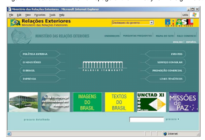
Figure 1: Illustration of the homepage of the Ministry for Foreign Relations (MRE) website

Participants performed five tasks in each of these websites. The test was done in their own environment of Internet use, either at work or home. They also used their own computer. Most of the participants used a desktop computer, 15 inch-monitor with a resolution of 800 x 600 pixels. Both the think-aloud test and the interview were recorded by an audio tape recorder. In addition to the recorded data, the investigator observed and took notes during the tests.