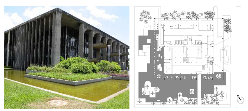
Figure 1. View from the Southwest comer. Figure 2. Reflecting pool (gray hatch).

Designed by the architect Oscar Niemeyer in 1962, the Palace of Justice Raymundo Faoro, located on the Ministries Esplanade, is the headquarter of the Ministry of Justice. As suggested by Lucio Costa, both the Palace of Justice and the Itamaraty Palace, headquarter of the Foreign Ministry, were designed differently from the other ministries (designed as rectangular bars), as a way to create a visual enclosure to the Esplanade [7]. Both buildings were designed as square volumes with the same height sitting on a reflecting pool. The similarities between the two buildings do not end here; both have reinforced concrete structure designed to provide extreme lightness to the arches and pillars that form the façades, as well as the use of free plan, free façade, roof garden and integrated artworks.