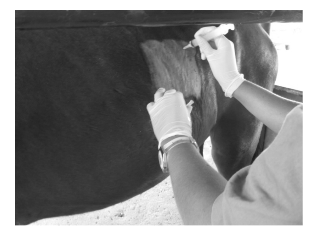
Figura 1 - Splenic puncture procedure. The 25 x 30 needle is inserted at 90° angle on the 17<sup>th</sup> intercostal space.