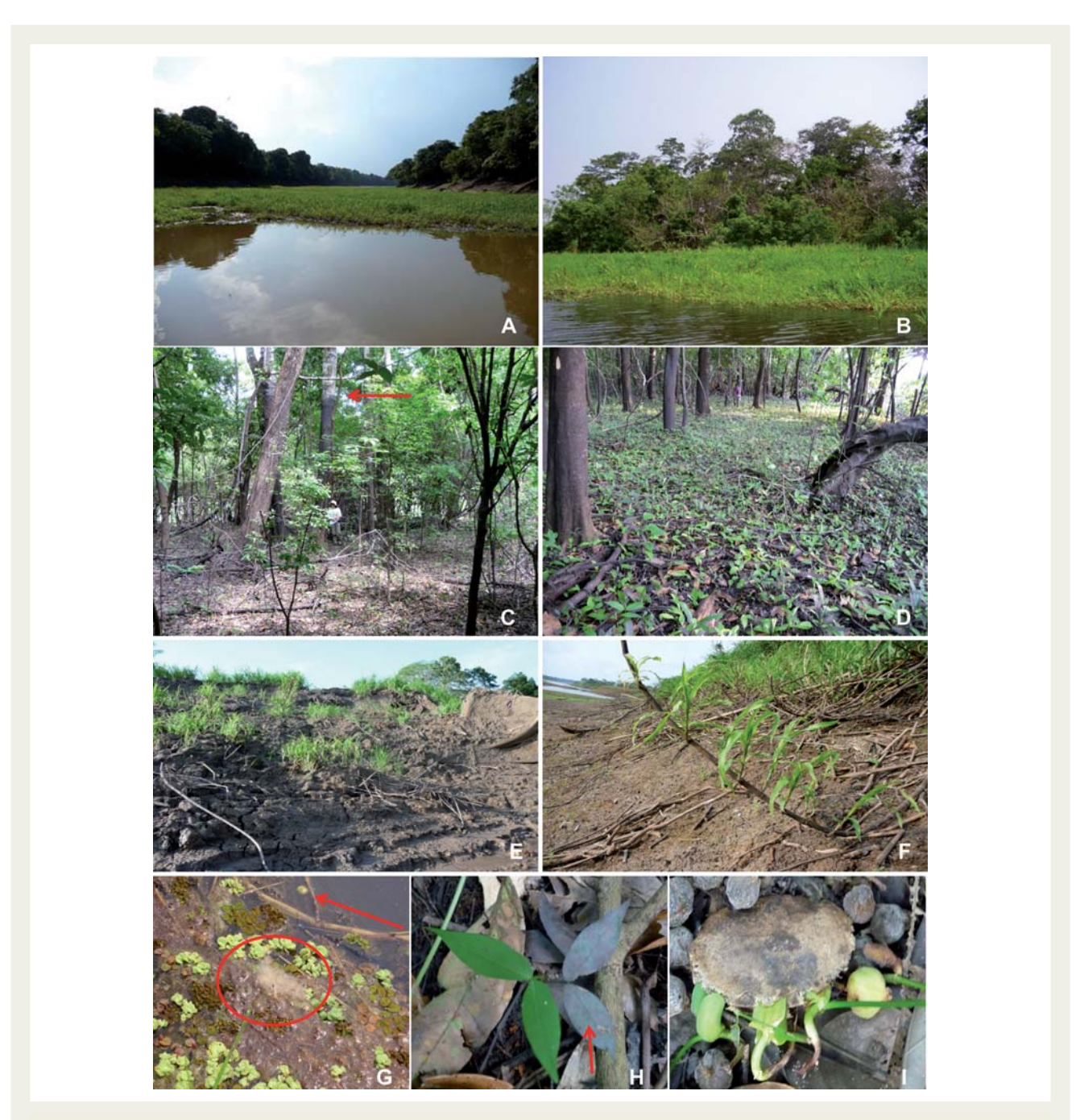
Fig. 1 Features of the várzea floodplain vegetation. (A) Várzea lakes colonized by macrophytes; (B) floating grasses on the edge of the flooded forest; and (C) interior of the forest during the terrestrial phase (the arrow points to a mark left in the tree that indicates the water level reached in the last flood); (D) extensive seedling bank in the interior of a várzea forest, about a month after water retreat; (E) colonization by seed-germinated plants of Paspalum fasciculatum ; (F) colonization by vegetative regrowth of P. fasciculatum ; (G) seeds of Pseudobombax munguba (circle) and other fruits (arrow) floating in water; (H) Clusiaceae seedling with new recently produced leaves and old leaves (arrow) which have survived the last flood (still covered with sediment); (I) seed germination in water of an unidentified legume.

factors and determine the position of the closed-forest border, which is generally located where the height of the water column reaches between 7.5 and 8 m or 228 days of flooding per year on average. Monospecific