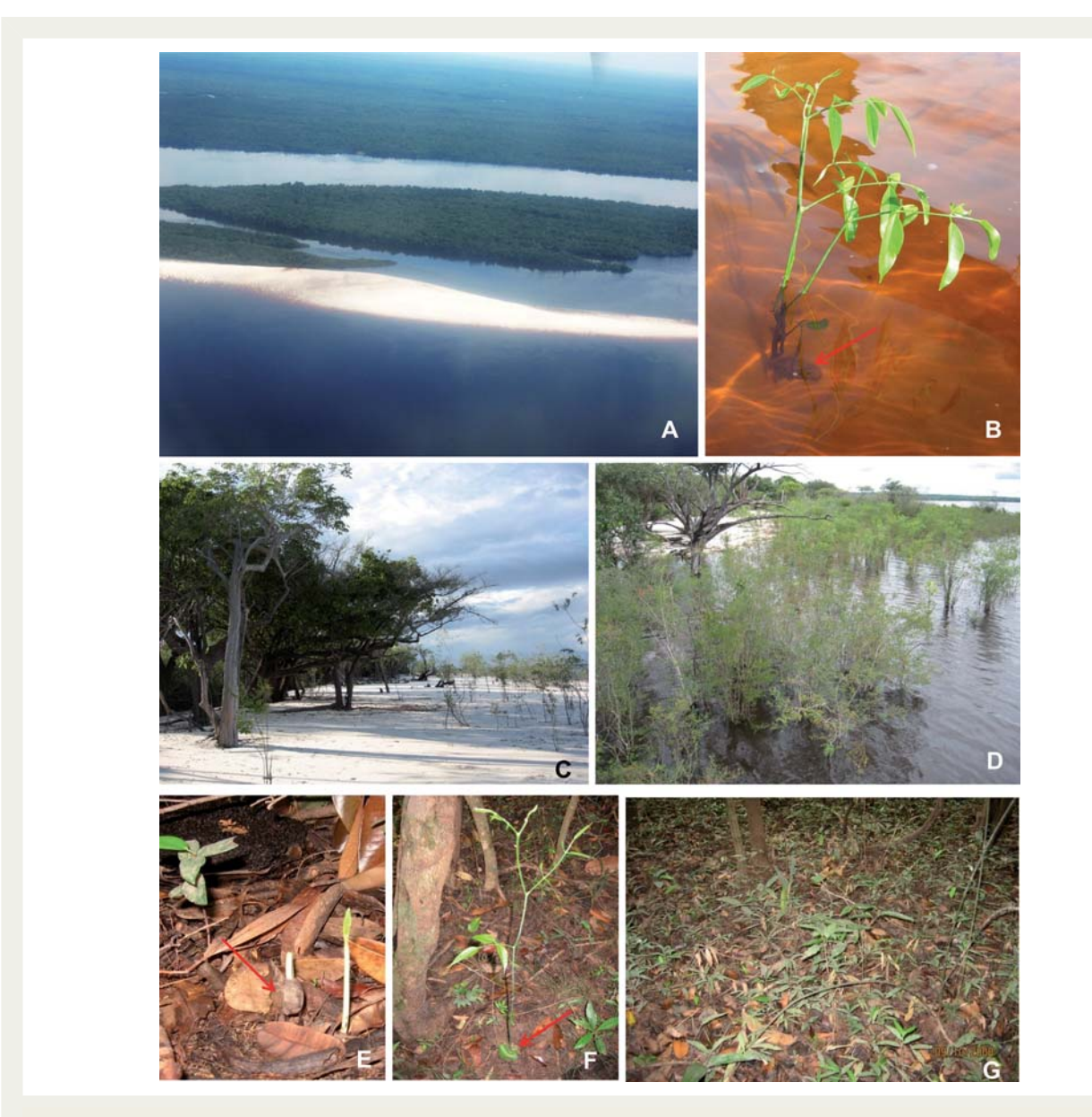
Fig. 2 Features of the igapó floodplain vegetation. (A) Aerial view of the igapó forest; (B) water-germinated seedling at the end of the flood period; (C) igapó lakes showing the absence of colonization by macrophytes; (D) colonization of the igapó shores by pioneer woody perennials during the period of water retreat; (E and F) seedlings that germinated in the igapó forest following the water retreat; (G) seedling bank of Astrocaryum jauari which have survived the last flood. The arrows in (B), (E) and (F) are pointing to seeds that contain large cotyledonary reserves.

border and dominate the river banks. They are followed along the flood-level gradient by typical early secondary tree species, such as the genus Cecropia which can reach ages of 10–30 years. Subsequently, late secondary species Crataeva benthamii (Capparaceae) and Pseudo bombax munguba (Bombacaceae) can be found, which can be 20–100 years old. These are followed by welldeveloped low-várzea forests, where there are species with ages up to 400 years, such as Piranhea trifoliata