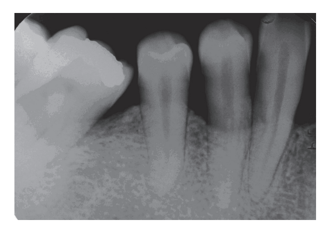
Figure 2- Six-month postoperative radiograph

using diagnostic subtraction radiography software, IDL- Interactive Data Language v.5.0 (Research Systems, Boulder, CO, US) developed for this purpose (Figure 3). The routines of the program work on the platform of the Envi 3,5 (ITT Visual Information Solutions, Boulder, CO, USA), software solution for processing and analyzing images that allows development.