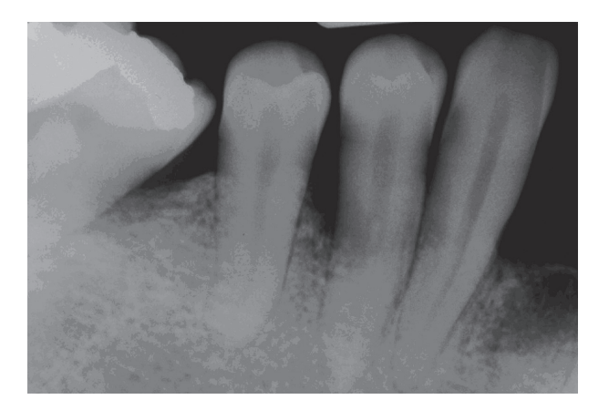
Figure 1- Preoperative radiograph

Periapical radiographs were taken with the aid of an acrylic device (Resapol T 208, Outline Fiberglass, São Vicente, SP, Brazil) made by duplication of a positioner-matrix (Dentsply Rinn, Elgin, IL, USA). The device was coupled to a bite block made of acrylic material (Duralay, Reliance Dental Mfg. Co, Worth, IL, USA) at each site to retain reproducible projection with exposure settings of 70 KV at 8 mA for 1.0 second. Radiographs were taken at baseline and 6 months (Figures 1 and 2). The radiographic films were developed in an automatic radiograph processing machine (Perio-pro II, Air Technique Inc., Melville, NY, USA). The radiographic pairs were scanned and digitized using a 35-mm slide scanner (Polaroid SprintScan, Polaroid Corporation, Simi Lalley, CA, US) connected to a Pentium 100 Mhz PC (Intel Corporation, Santa Clara, CA, USA). The baseline presurgical and postoperative images were aligned by the selection of common reference points<sup>10</sup>. The images were subtracted and analyzed