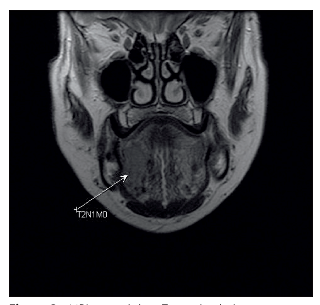
Figure 3 - MRI coronal slice, T_2 -weighted, showing a tumor of isosignal intensity at the base of the tongue (arrowhead), on the right side.

and MRI staging, and agreement was significant only for Observer 4. Among these results, three cases were staged as belonging to the IVA grouping, which represents lesions which are larger and at a more advanced stage, thereby facilitating diagnosis.<sup>15</sup> This confirms the greater importance of the MRI exami-