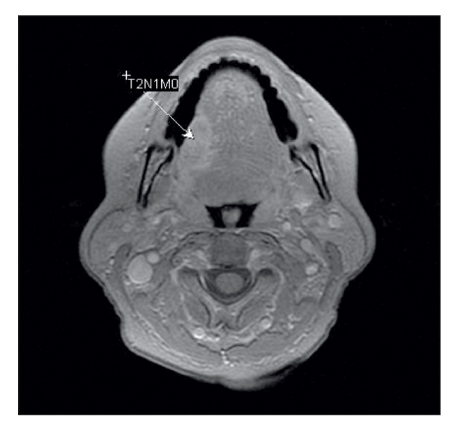
Figure 2 - MRI axial slice, T_1 -weighted, with contrast, showing a tumor of hyper-signal intensity (enhanced with contrast) at the base of the tongue (arrowhead), on the right side.

and MRI staging, and agreement was significant only for Observer 4. Among these results, three cases were staged as belonging to the IVA grouping, which represents lesions which are larger and at a more advanced stage, thereby facilitating diagnosis.<sup>15</sup> This confirms the greater importance of the MRI exami-