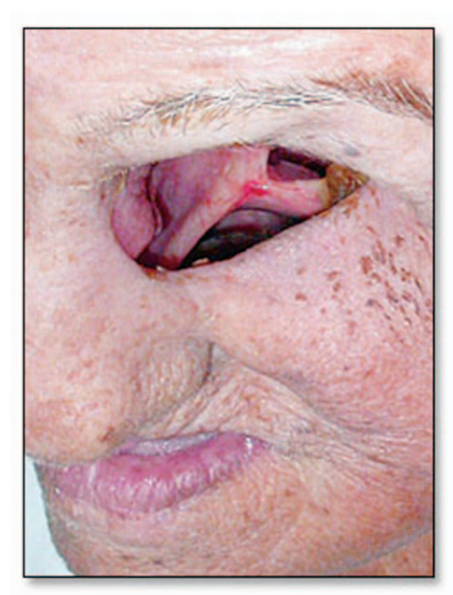
Figure 2. Oblique view of the anatomical defect showing the communication with the nasal cavity.

problems, such as difficulty with breathing, chewing, deglutition, speech as well as serious psychosocial problems.